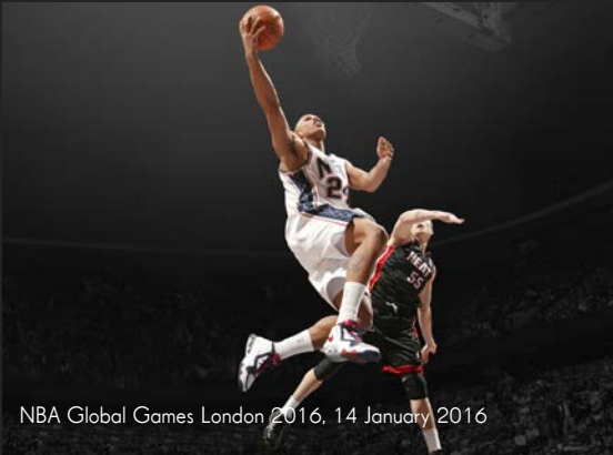
NBA Global Games London 2016, 14 January 2016

It doesn't matter what kind of entertainment you want to see, you've got the best seats in the house.