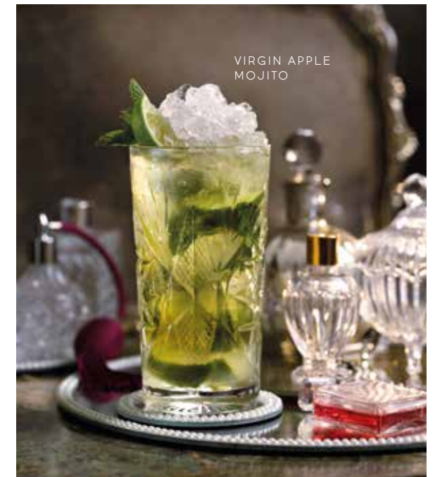
VIRGIN APPLE MOJITO