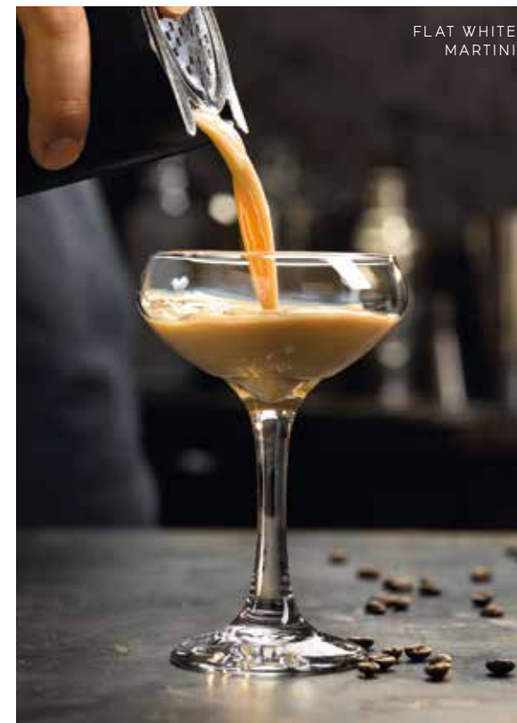
FLAT WHITE MARTINI