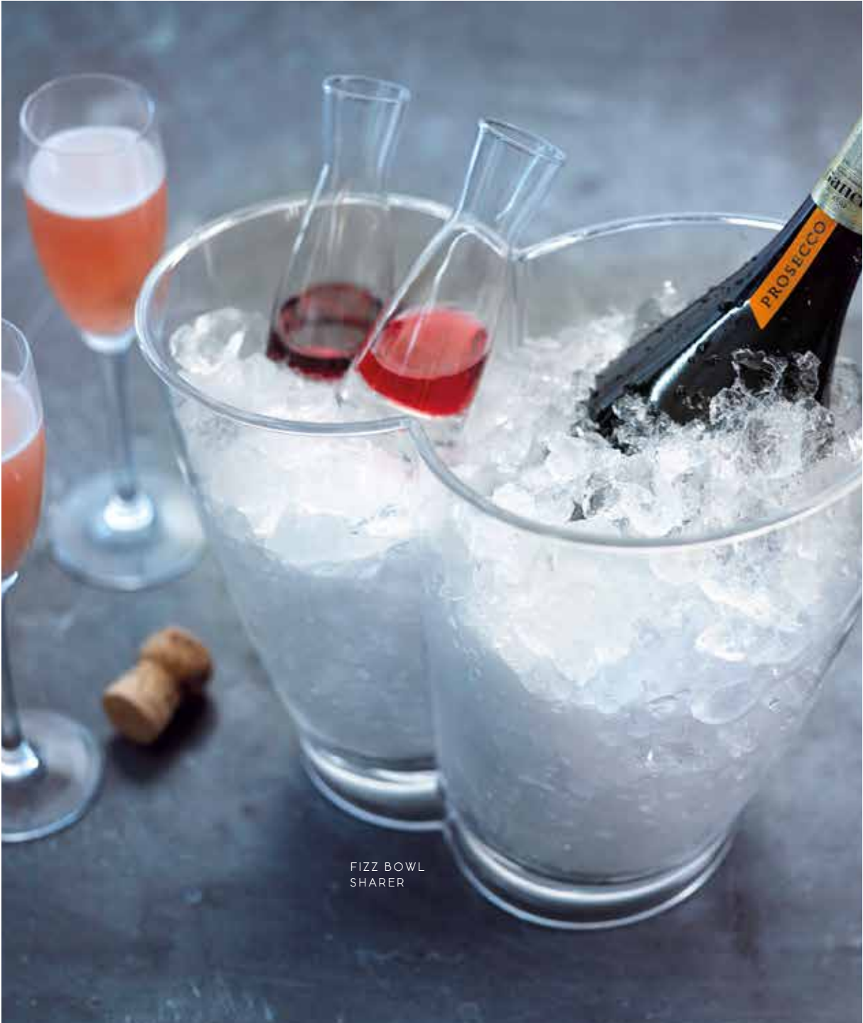
FIZZ BOWL SHARER