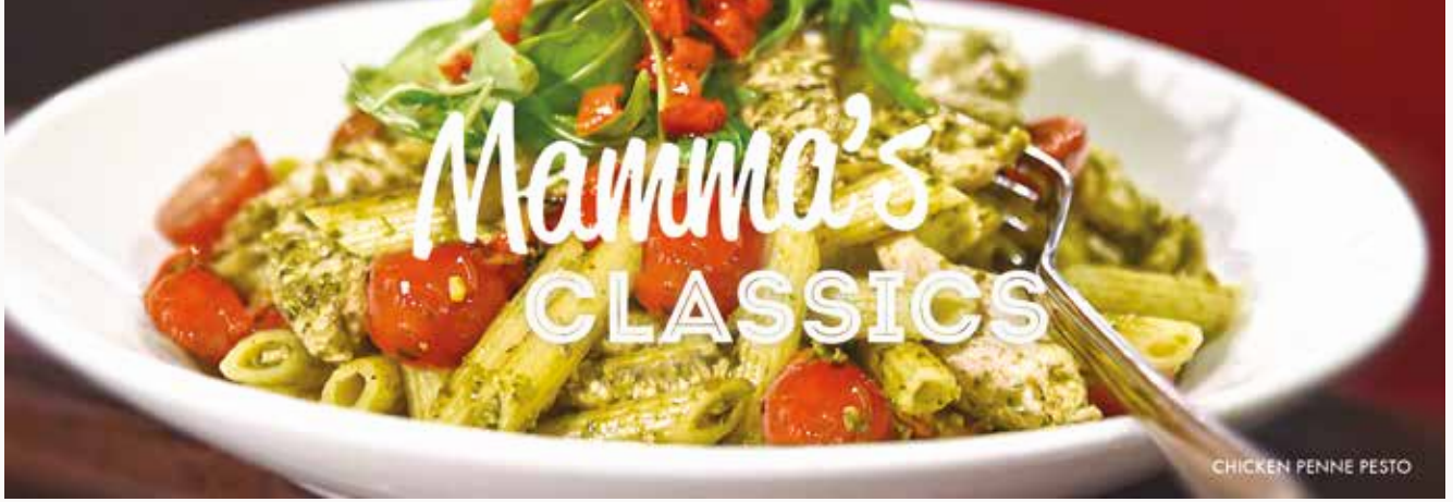
CHICKEN PENNE PESTO