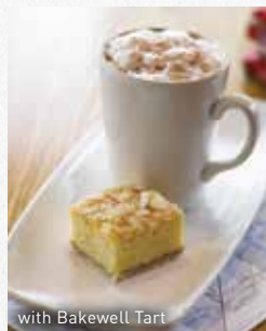
with Bakewell Tart

Serving LAVAZZA Italy's favourite coffee