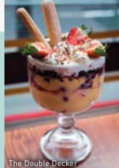
The Double Decker

The ultimate sundae! Layers of sponge fingers, summer berry compote and custard with chunks of brownie, chocolate honeycomb, toffee flavour sauce and vanilla ice cream, finished with whipped cream, strawberries and sprinkles