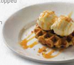
Toffee Crunch Waffle

A cinnamon waffle served warm with two scoops of vanilla ice cream, drizzled in toffee flavoured sauce and sprinkled with toffee pieces