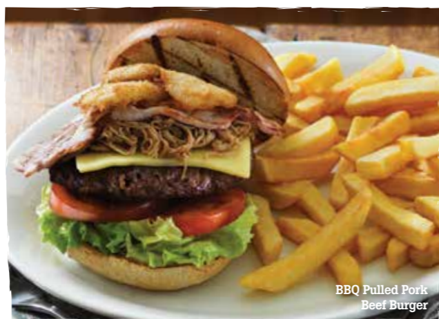
BBQ Pulled Pork Beef Burger