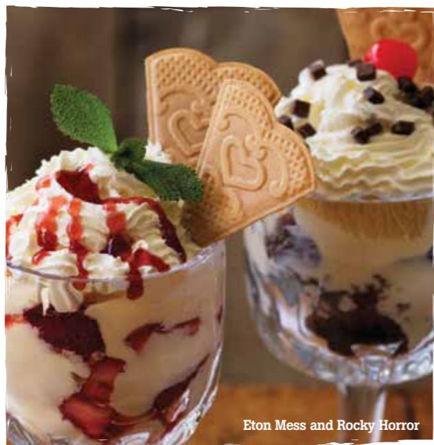
Eton Mess and Rocky Horror

Full nutritional information is available at www.harvester.co.uk/nutrition or scan this code