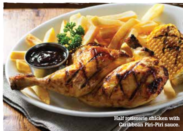
Half rotisserie chicken with Caribbean Piri-Piri sauce.