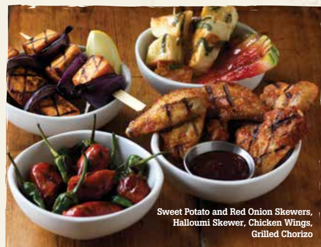
Sweet Potato and Red Onion Skewers, Halloumi Skewer, Chicken Wings, Grilled Chorizo