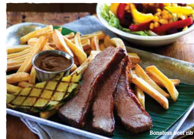
Boneless beef rib