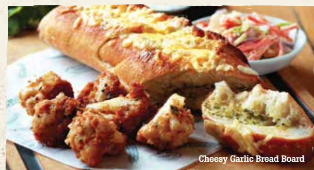
Cheesy Garlic Bread Board