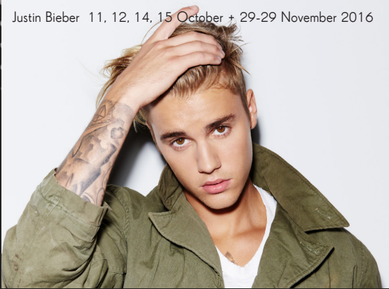
Justin Bieber 11, 12, 14, 15 October + 29-29 November 2016