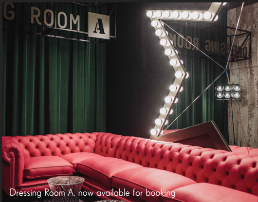
Dressing Room A, now available for booking

Membership is £5625 (plus VAT) for 15 months for one person (1 October 2016 – 31 December 2017).