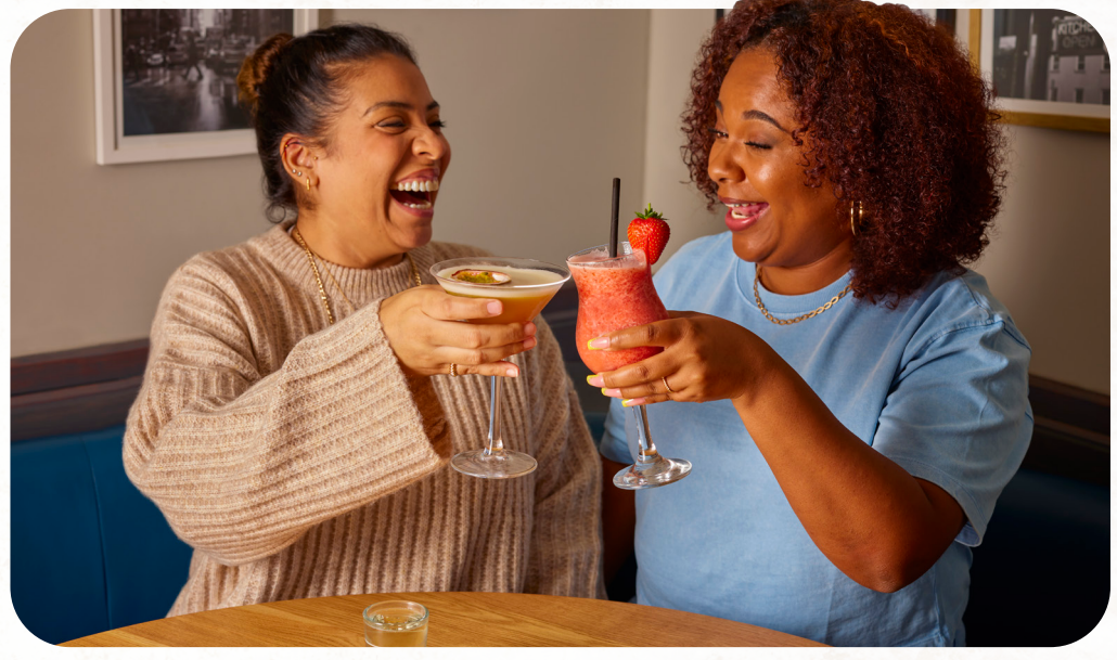
Pictured: Drinks for every mood