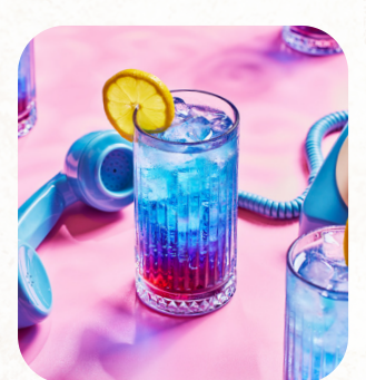
Guess who's back: Purple Rain

Beefeater gin & Chambord mixed with lemon & sugar, with a berry garnish